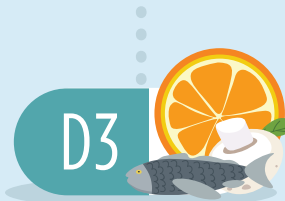
Vitamin D3 3000-5000 IU Daily