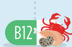
Vitamin B12 350-500 MCG Daily