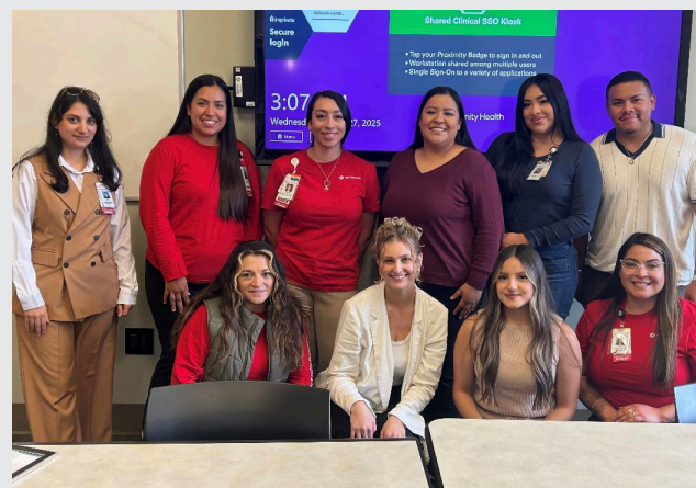
Community Health Worker Team