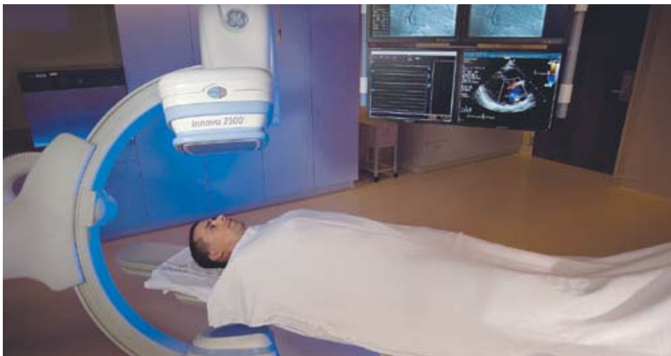
Saint Alphonsus Cardiac Catheterization Lab

More recently in March, Olsen held a two-day course at West Valley for nurses and respiratory therapists to enhance staff training and knowledge in the stabilization of post-resuscitation and pre-transport of neonatal babies based on STABLE measures, standing for: sugar, temperature, airway, blood pressure, lab work and emotional support.