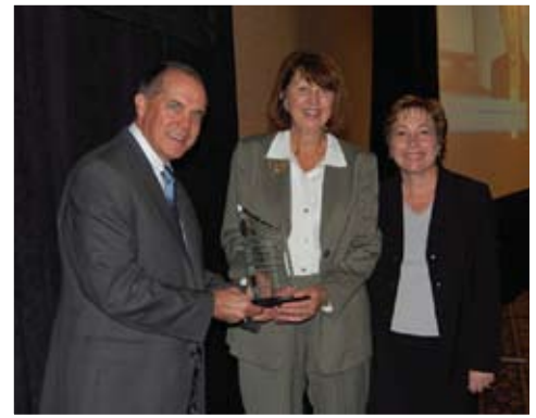
Alliance Wins Idaho Business Review's "Advancements in Health Care Hero" Award